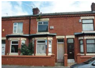
9 Parkdale Avenue, Gorton, Manchester