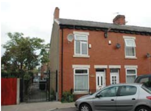
35 Prout Street, Longsight, Manchester