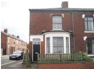
129 Mossley Road, Ashton-u-Lyne, Lancashire