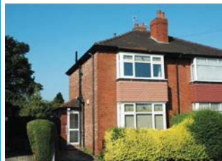
13 Penrhyn Road, Edgeley, Stockport