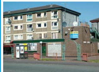
The Highland Laddie, Rochdale