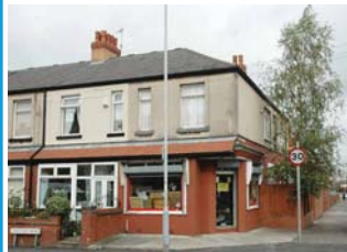
17 Longford Road, Reddish, Stockport