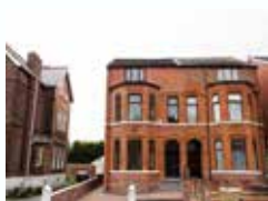
Rectory Road Crumpsall