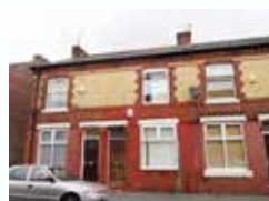
Chilworth Street Rusholme