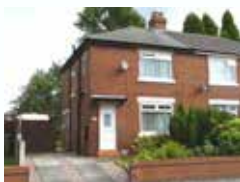
Chester Street Denton