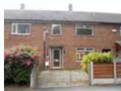
Greenbrow Road Wythenshawe