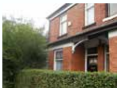
Highfield Road Prestwich