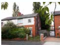
Crompton Road Burnage