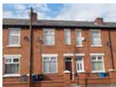
Wetherby Street Openshaw