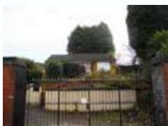
Rochdale Road Blackley