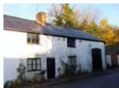
Mill Brow Worsley