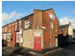
Reddish Lane Gorton