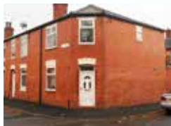
Clevedon Street Harpurhey