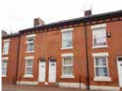
Stanton Street Clayton